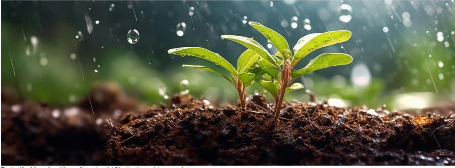
The health of the soil and the quality and availability of water are interconnected.